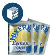
LEMON SOUR dose for 1 liter 70 GR

Two Bartender solutions popular still today! Perfect cocktail cherries to garnish and lemon sour powder balanced with the right amount of lemon juice and egg albumin to make an attractive head which will remain until the last sip.