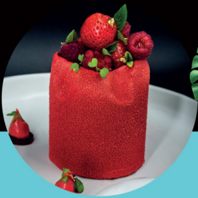
★ Dessert ★