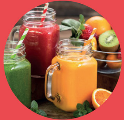
★ Healthy ★