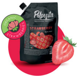
STRAWBERRY fruit puree

■ NO FLAVOURINGS ■ NO COLOURINGS ■ NO PRESERVATIVES