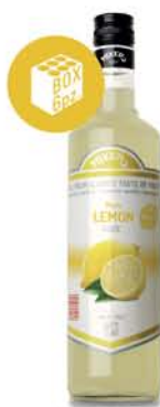
LEMON JUICE pure lemon 99,5% 70 CL