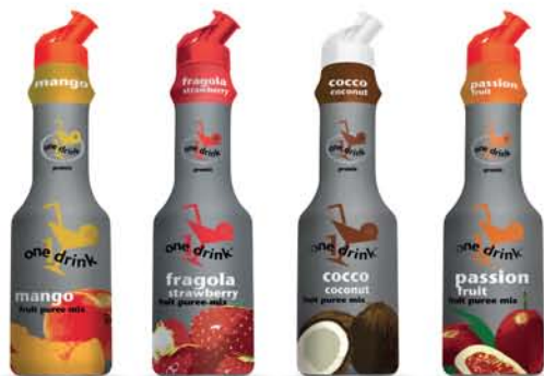
MANGO puree mix STRAWBERRY puree mix COCONUT puree mix PASSION FRUIT puree mix