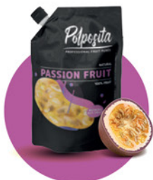
PASSION FRUIT fruit puree