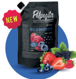
WILDBERRIES fruit puree