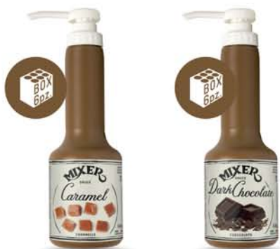
CARAMEL sauce 1,40 KG