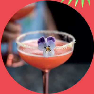
★ Cocktails ★