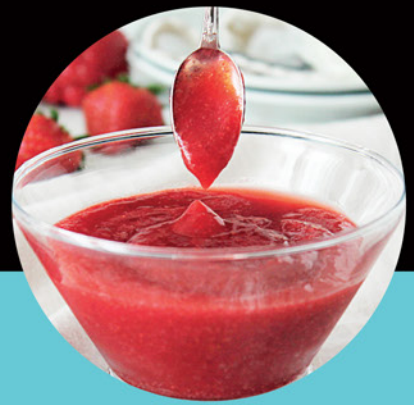
★ Coulis ★