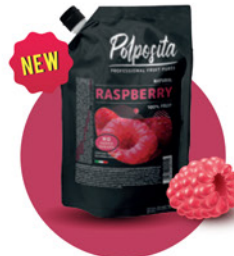
RASPBERRY fruit puree