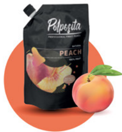
PEACH fruit puree