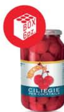
RED CHERRIES with stem 800 GR