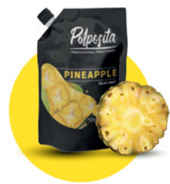
PINEAPPLE fruit puree