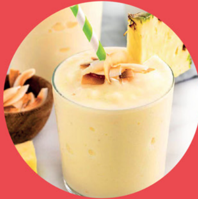
★ Smoothies ★