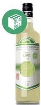
LIME JUICE pure lime 99,5% 70 CL

Lime CORDIAL is made with a careful blend of pure fruit juice with balanced sweetness to create refreshing beverages.