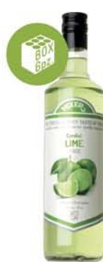
CORDIAL LIME 70 CL