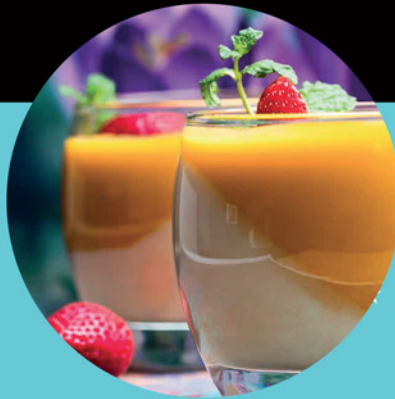
★ Mousse ★