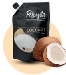
COCONUT fruit puree