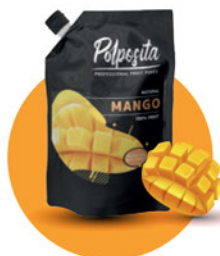
MANGO fruit puree